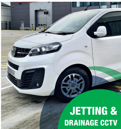
JETTING & DRAINAGE CCTV